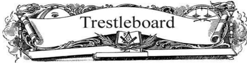
Table Rock Lodge #680 November 2022

Lodge physical Address: 54 Kimberling Blvd. Kimberling City, MO 65686